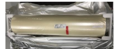
HMA for OPV