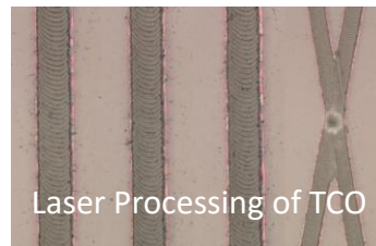
Laser Processing of TCO